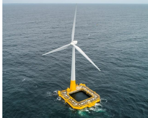
(Picture: Concrete floating offshore wind turbine using Ideol's Damping Pool®)